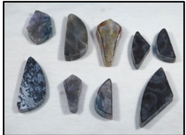
Preforms Ready For Dopping

Some have found traditional wooden dowel dop sticks and wax to be awkward, messy, somewhat unreliable (popping off when wet?), and most of all, slow and time consuming. Dopping small stones on small diameter sticks is difficult enough but in addition it is hard to hold and control a small diameter stick (especially as we get older). Furthermore if you are one who wants to make cabochons for wire wrapping you may like to scribe a line around the perimeter for the intended girdle after you have established the outside shape. This requires de-mounting the stone, placing the stone on a flat surface, scribing the guide line around the edge and re-dop the stone to finish.