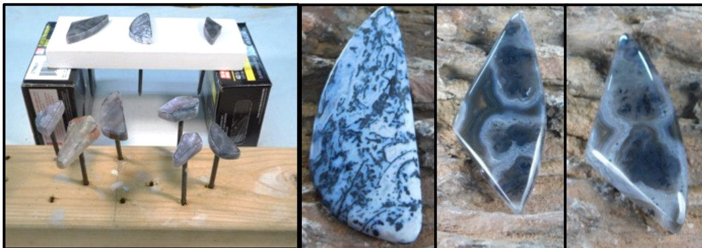
Dopping Stand (bot.) and Marking Board (top)

When the cabs are complete place the stone(s) with the nail attached into a sealed jar with a small amount of acetone to dissolve the CA or epoxy. You do not need to cover the stone, simply remaining in the sealed jar with the solvent will loosen it, but you may need a little more solvent to clean the screw head. Or if you're impatient use a small torch to heat the nail and the stone will pop right off.