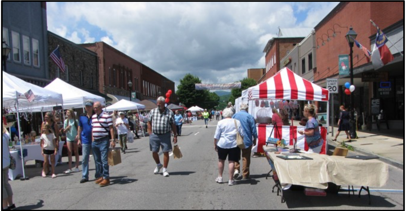
Early Morning Visitors on Main Street

Thank You for your encouragement & support.