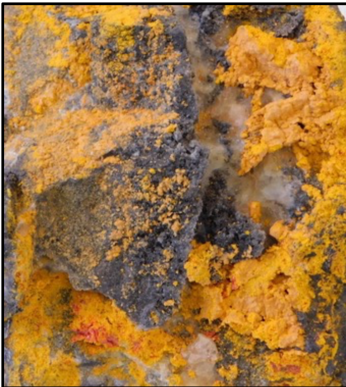
Arsenic Specimen From Nevada

Arsenic is neither a metal nor a non-metal but instead joins an ill-defined group of elements called the metalloids. Most metalloids occur in several forms where one might seem metallic while another one seems non-metallic. Arsenic doesn't seem much like a metal in its yellow form, but it also has a grey form known as metallic arsenic.