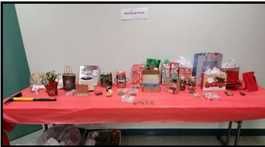
The Booty...to be seized in the war of Rock Bingo