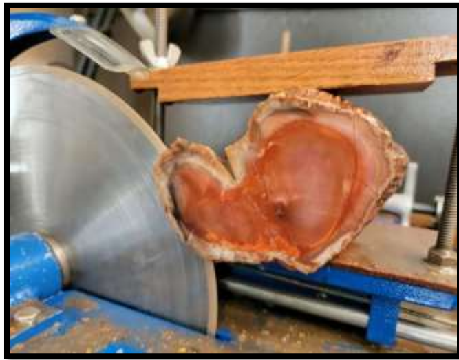
Piece of petrified wood being slabbed

Big Gift Shop news! For those of you who host the museum and remember that large Sodalite blue clock that has been for sale forever in the gift shop, it SOLD! Big thanks to Brad Fleszar for being so helpful in fixing the clock mechanism (made the clock actually work) because it sold two weeks later!