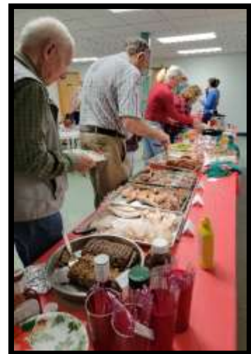
Everyone digs in!