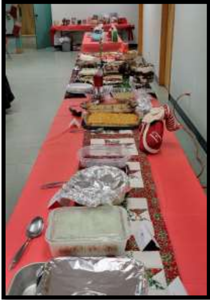
Check out this spread!