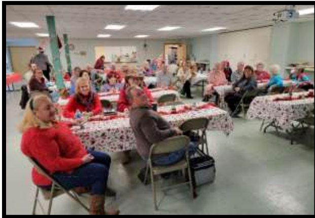
What a happy crowd!