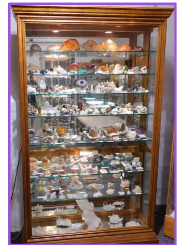
Display case now in place

Newsletter Editor: Stacy Walbridge stated the deadline for the newsletter is November 10th.