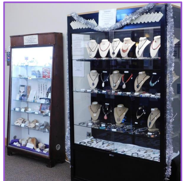
Mineral and gift displays at the library