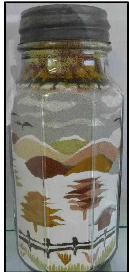
On display in the museum.