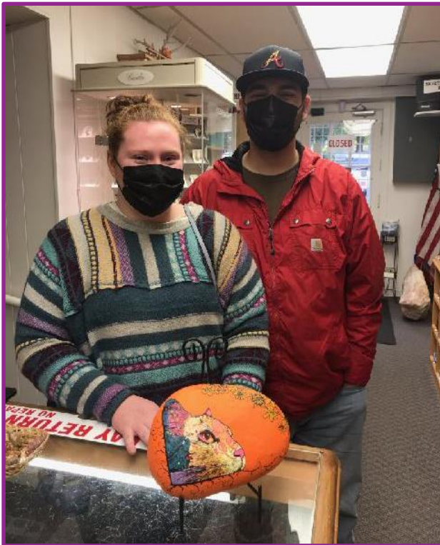
Silent Auction winner showing off the winning prize in our Museum.